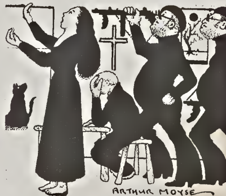
"MOTHER OF CHRIST, NOT ANOTHER BLOODY ARMY OF LIBERATION."

With independence in 1960 the island voted Archbishop Makarios as its first President. Makarios has supported EOKA and their aim of Enosis, but when in power he soon changed his mind and decided to keep Cyprus an independent republic. Yet this was his strength and his weakness because he would never make a complete break with Greece, even after the army coup of 1967