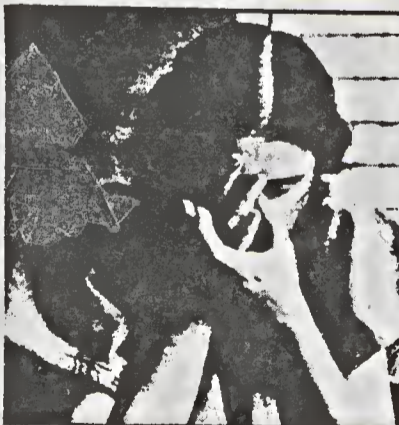
We will need a mental health system very different from what is currently on offer"

against people who receive, or have received, psychiatric services - with particular regard to housing, employment, insurance, etc.