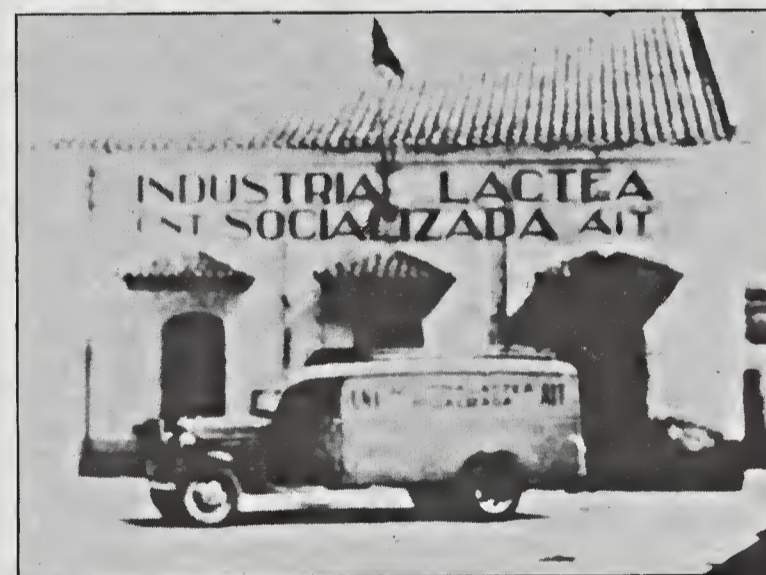
Dairy under workers' control, Spain 1936

What can be done? Make sure you claim for single payments before 15th March and that you are getting the weekly additions you are entitled to. Local authority workers, unions and voluntary workers in other agencies are refusing to co-operate with the Social Fund - it's essential that unions and claimants alike support and encourage these moves. It is also important to campaign against this by linking it to other attacks on our class - the poll tax, the removal of the NHS - only then can this be defeated.