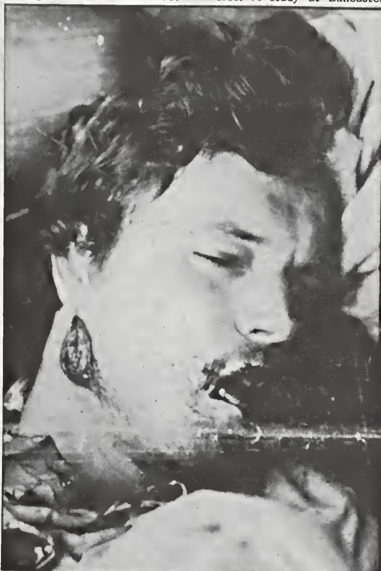
Plastic Bullets Victim