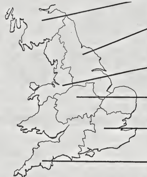
The Economic League's regional boundaries, addresses and phone numbers