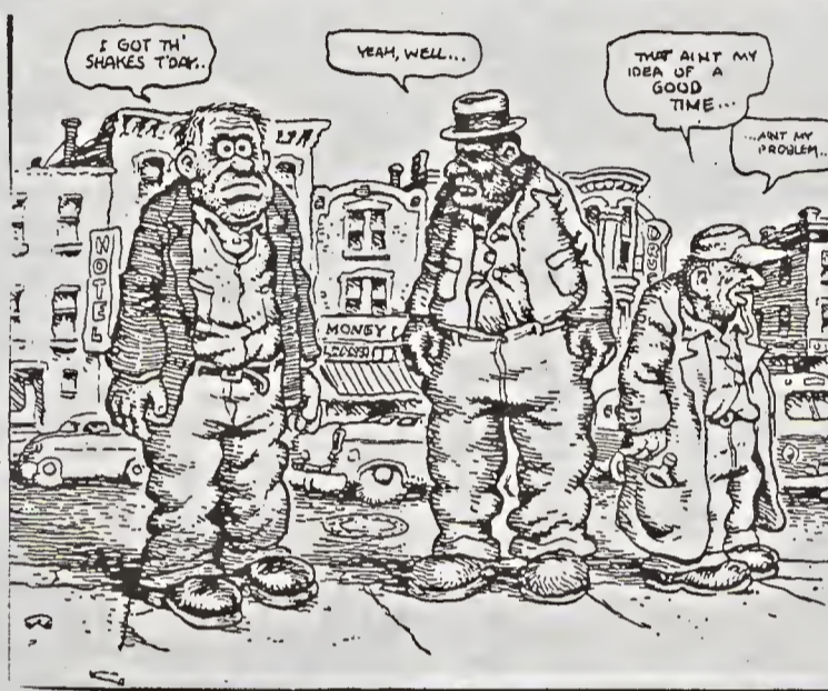
Out in the ever-loving community ex long-stay patients are visibly "different"

I'd like to end by saying that we users need not and will not take this lying down - nor need others stand by and watch it happen. It might be you or someone you know who needs psychiatric care in future. There are campaigns involving users and ex-users to improve services and force the Tories to put their money where their mouths are. This also needs mental health workers' involvement and like all workers in struggle, they will need support from other workers. We cannot allow the current farce to continue unopposed with different health authorities fighting among themselves and fighting local authorities for cash and voluntary organisations scrambling around for cash also, or the end result will be a disaster, not progress.