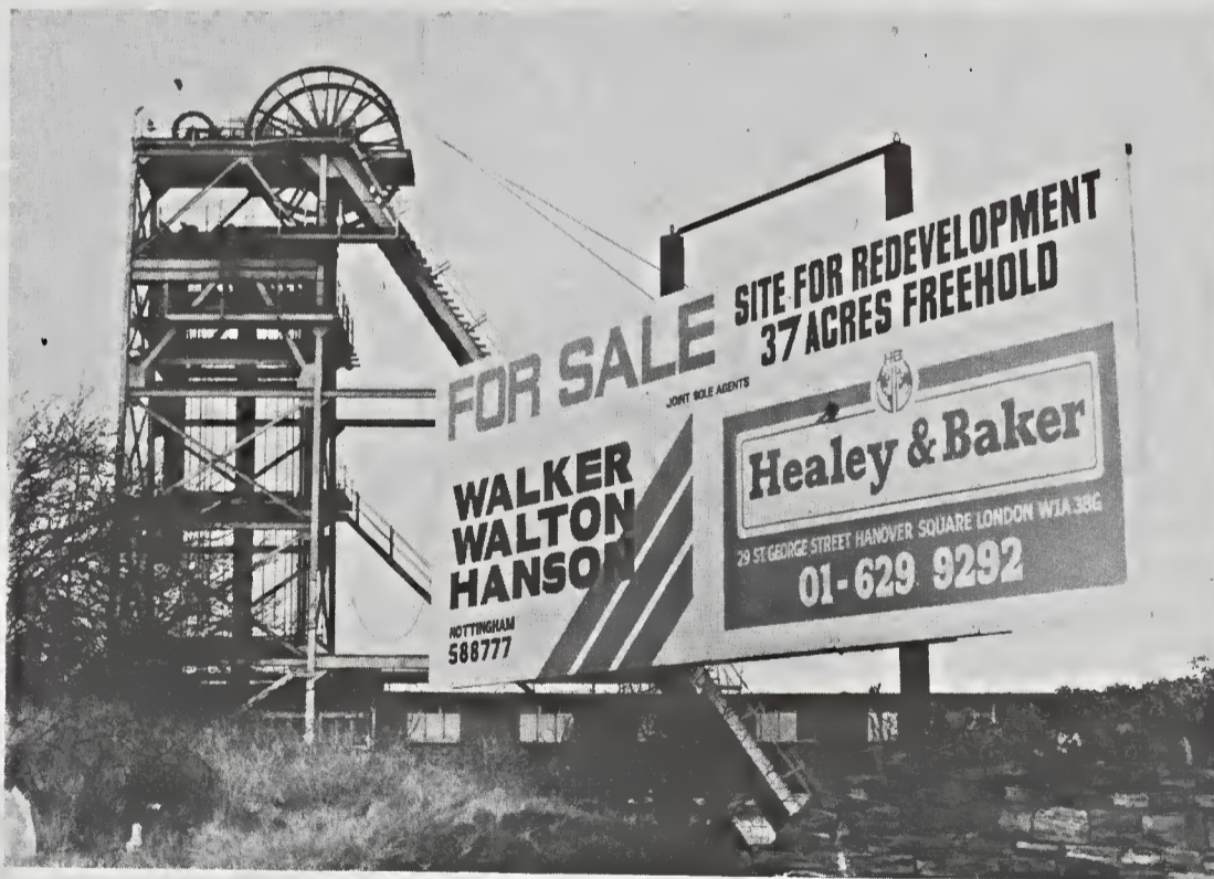
Yet another pit closure in Notts